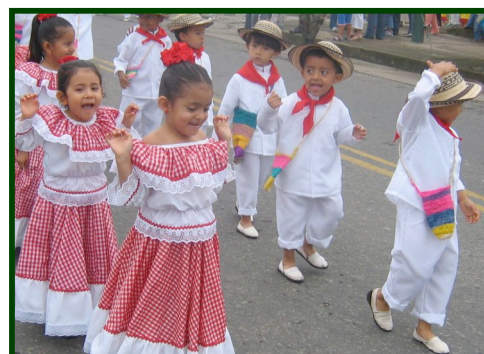
Kindergartners during Colegio Americano Menno's 50 th Anniversary parade. Read more about the celebration at http://www.mennonitemission.net/resources/news/story.asp?ID=828 .

Mission is first and foremost an act of incarnation: being with people where they live. This year may Christmas also be first and foremost about being with God's people, celebrating the God who became one with us. Merry Christmas!